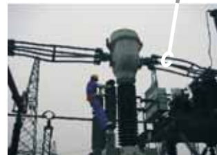
Tube busbar or aluminum stranded connector